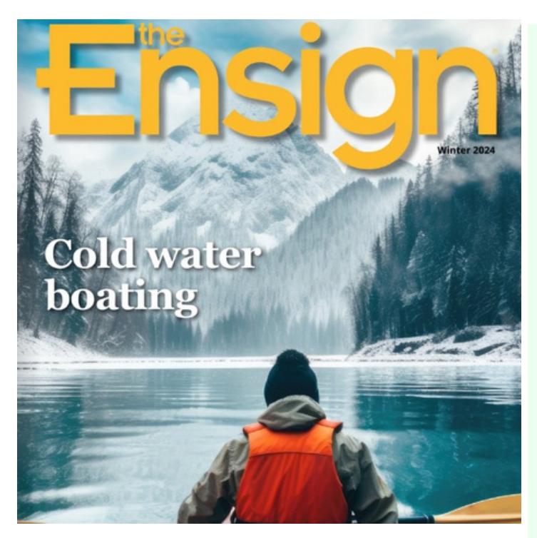
Start the new year off right by diving into your favorite boating magazine! The Winter 2024 issue of <u>The Ensign</u> is out now.